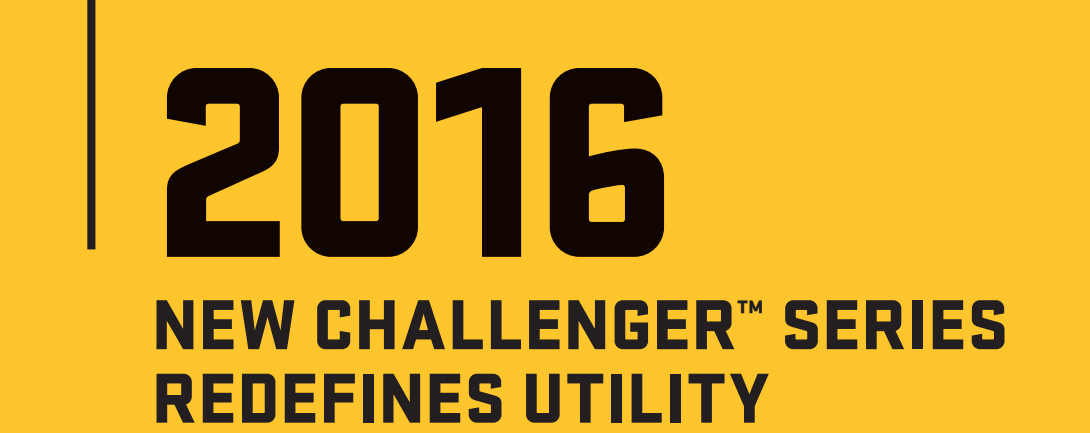
COMMERCIAL INDUSTRY'S FIRST DUAL-WHEEL STEERING WHEEL MOWER DESIGNED FOR HILLS